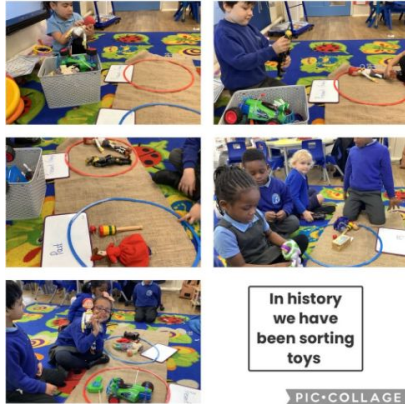
In history we have been sorting toys

We developed our oracy and listening skills by sharing our favourite toys with our friends, thinking about what makes them special to us and the materials they are made from.