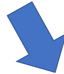
Comparing and contrasting 3 Victorian healthcare heroes.