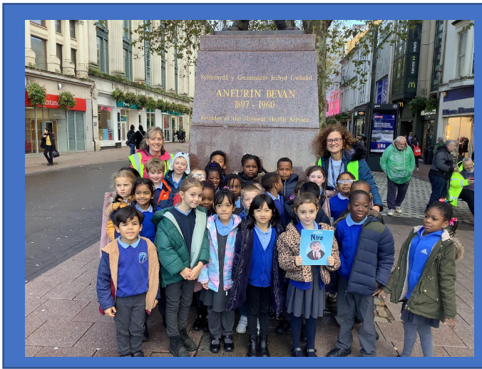
We walked to see the Anenurin Bevan statue, a Welsh healthcare hero.