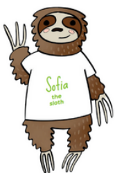
Caring for God's gifts Stewardship

This term we are teaching the principles of Stewardship and Human Dignity.